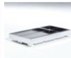
Unperforated tray with rollers, suitable for liquid loads, stainless steel, 592x292x35 mm.