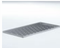
Perforated tray, aluminum, 583x293x15 mm.