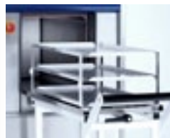
Set of shelves used for loading of containers (STU) and individual packs directly on the shelves.