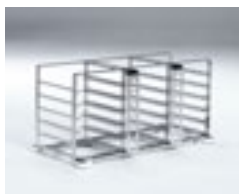
Rack on wheels for 18 dental cassettes, stainless steel.

We offer a wide range of accessories to choose from (see examples below). Further information is available at www.skarhamn.getinge.com