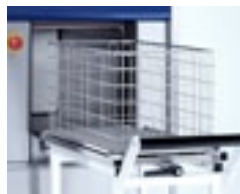
Loading of modular wire baskets, using the shelf rack (incl. wheels). For one wire basket 590x300x190 mm, 2-3 baskets 590x300x100 mm, or a combination.