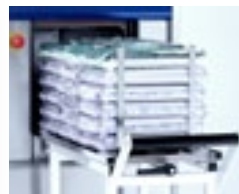
This dental rack enables sterilization of a single load of 18 dental trays, 290x190x35 mm (LxWxH).