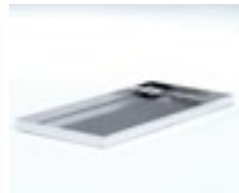
Unperforated tray, stainless steel, suitable for the sterilization of liquids, 603x297x30 mm.