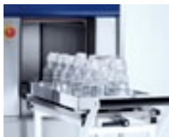
Lab version, Getinge HS33 Lab The sterilizer can be equipped with a system for liquid sterilization.