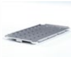
Perforated tray with rollers, stainless steel, 600x310x35 mm.