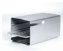
Fixed aluminum rack with three levels.