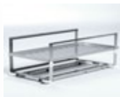
Rack on wheels with three levels, stainless steel.